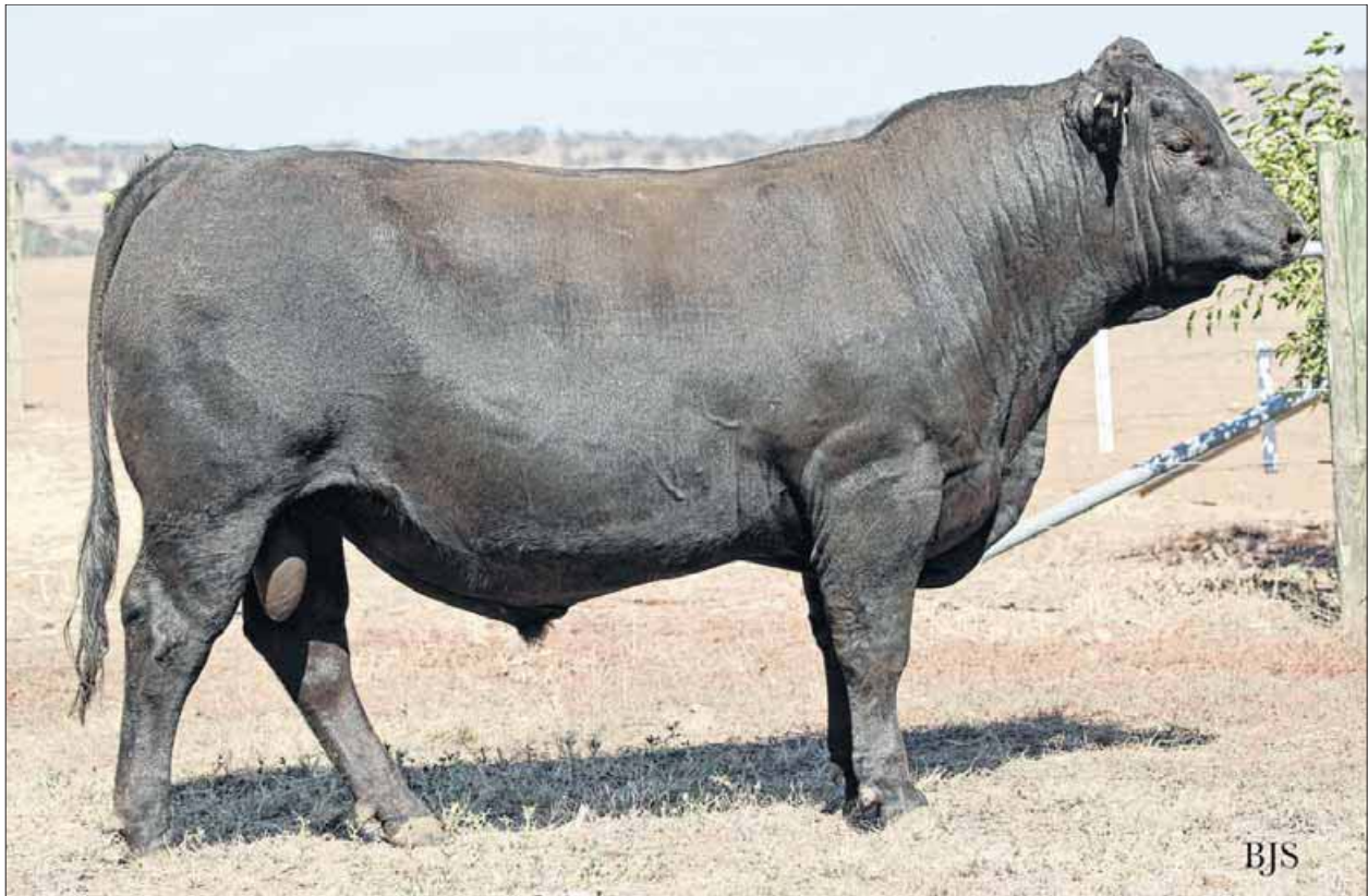
CHIP OFF THE OLD BLOCK: Witherswood Kingdom M0332, son of record price-getting Anus Bull Millah Murrah Kingdom K35, is expected to be the “pick of the bunch” at Witherswood Angus’ bull sale tomorrow.